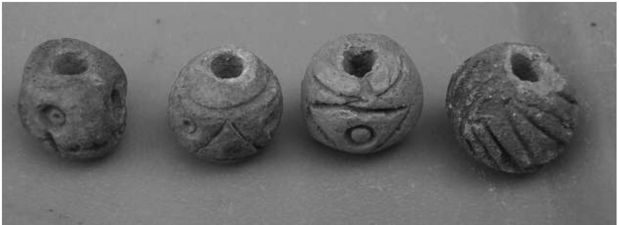
Four pottery beads illustrating possible "faces" (left two beads) and geometric motifs (right two beads)