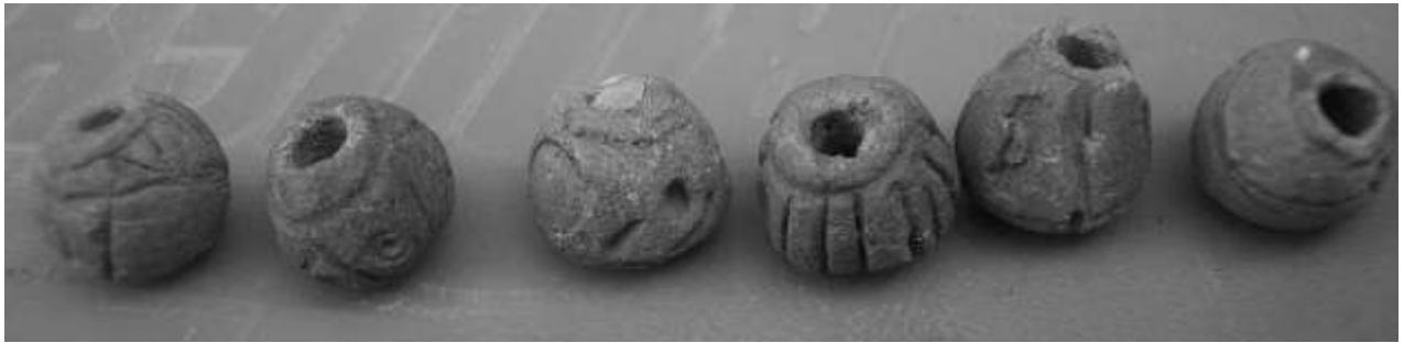
Six pottery beads