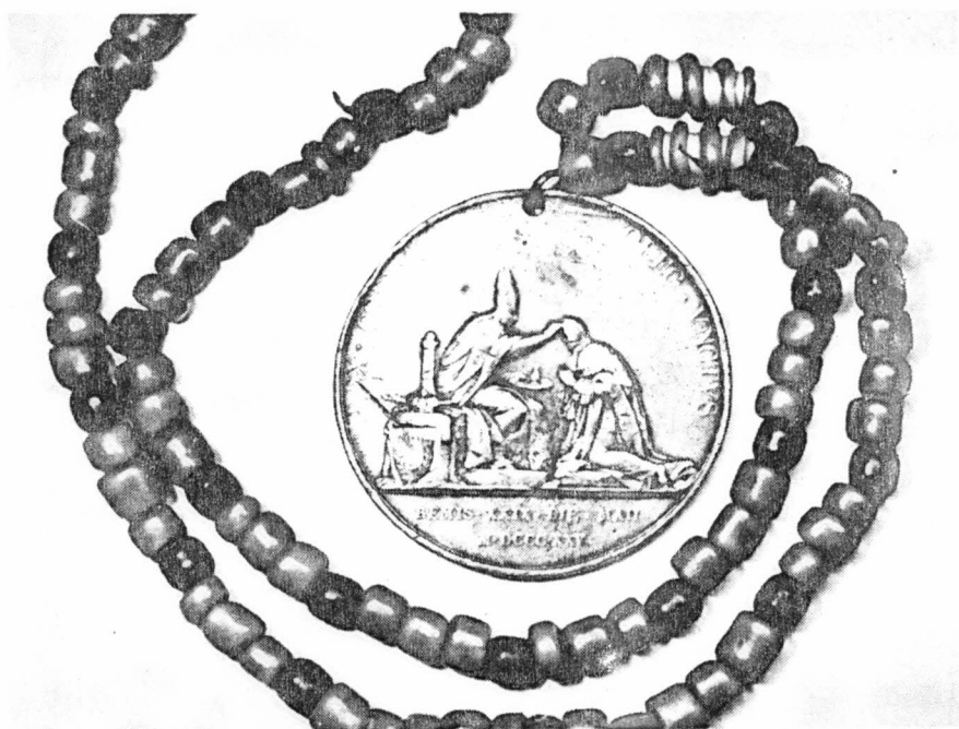
Figure 5 — Coronation medal of Charles X. Top: Obverse; bottom: reverse.