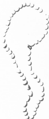
L Fosterland F-3 78 A 61-753-79