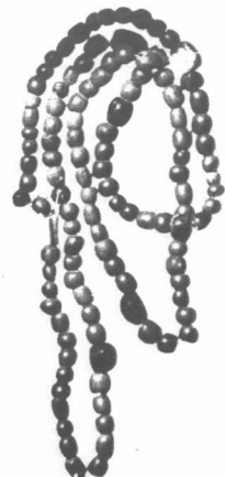
H Fosterland F-3 104-A 61-753-63