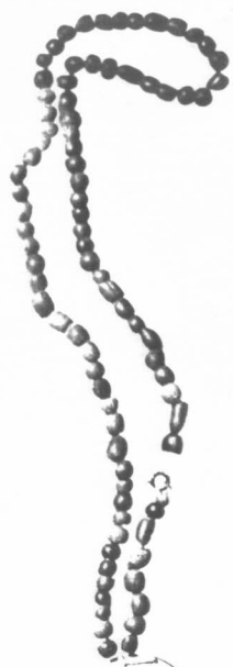
B Fosterland F-3 78 A 2387 61-753-23