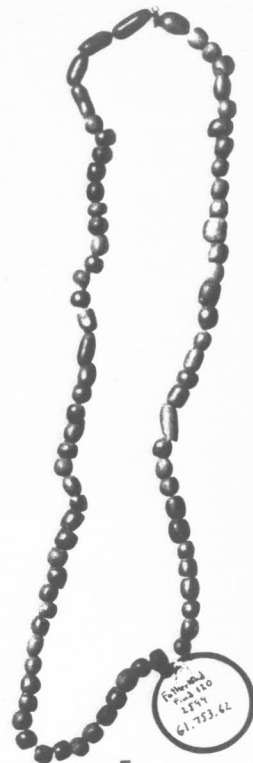
F Fosterland F-3 78 A 61-753-42